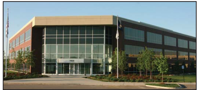
Altair World Headquarters, Troy, MI USA

Altair empowers client innovation and decision-making through technology that optimizes the analysis, management and visualization of business and engineering information. Privately held with more than 1,300 employees, Altair has offices throughout North America, South America, Europe and Asia/Pacific. With a 20-year-plus track record for innovative product design and development, advanced engineering software and grid computing technologies, Altair has more than 3,500 corporate clients representing the automotive, aerospace, government and defense, and consumer products verticals. Altair also has a growing client presence in the life sciences, financial services and energy markets.